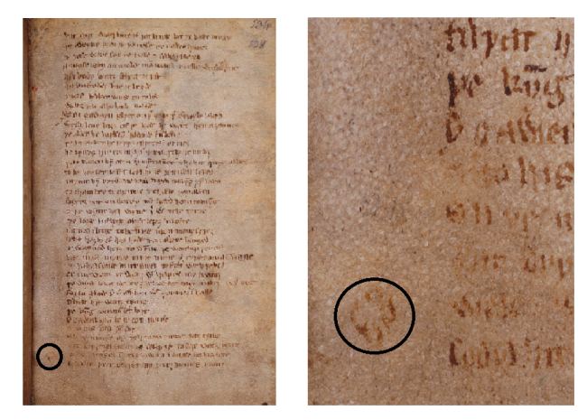
Figure 3. P14 discovered an asterisk in the form of a rose petal on a page of a manuscript. © The British Library Board, Cotton Nero A.x. (art. 3) f. 104/108.

this same data on standard-sized screens in their regular office environments without this success.