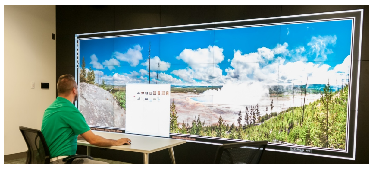
Figure 1. The 34.5 million pixel display wall used in the study.