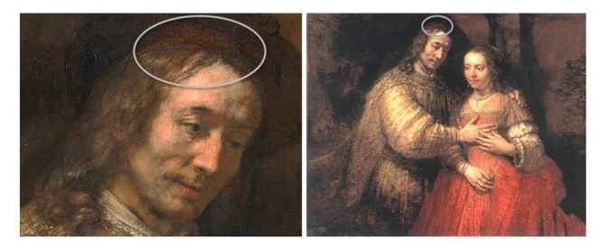
Figure 2. P5 discovered a yarmulke under a hat in The Jewish Bride [26].