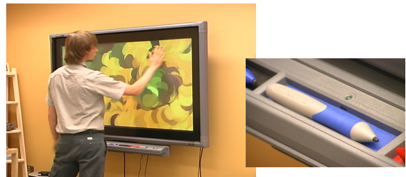
Figure 1: Hand postures in use and a pen as physical prop.

We extend the Interactive Canvas [SIMC07] that supports the creation of stroke-based renderings (SBR, [Her03]). The previous system only allowed indirect interaction through a set of widgets: a palette, tools, and a pre-defined set of primitives. During informal observations of the system's use, we discovered that this type of interaction was not sufficient to allow people to express their creative ideas. Several people expressed, in particular, the desire to create their own strokes in order to have more creative freedom. One person mentioned, e.g., that it is “hard to find a good cloud texture.” When more formally studying [GHC*07] an adapted system with an on-screen menu controlled by a separate Wii Nunchuck instead of the palette we gathered that participants had problems with recalling even a few actions (out of eight in this case; “you need a good memory to recall all the op-