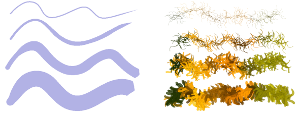
Figure 3: Strokes can be sketched with pen, one finger, two fingers, fist (left side). Strokes are rendered to texture and distributed with the one finger posture (shown on the right side) or the fist posture (this would produce more strokes within a larger region). The different colors of the strokes on the left side are derived from the underlying color image.

In distribution mode, however, the two finger posture is mapped to stroke alignment which can be used to organize strokes once they have been applied, for instance to emphasize certain structures in the image. While automatic alignments could certainly be derived, e.g., from image edges