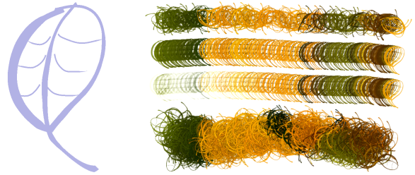
Figure 4: A sketched stroke (left) is first distributed with one finger, aligned with two fingers, faded with the hand, and redistributed with the fist posture (right, from top to bottom).

or gradients [Her03], our interactive alignment allows exploration of stroke alignment, providing more flexibly and creative freedom. Predominantly linear features can easily be created by sketching a stroke in alignment direction, distributing it on the canvas, and finally using the alignment posture. Here the two fingers of the posture serve as a natural indication of the alignment direction.