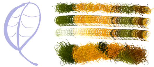
Figure 4: A sketched stroke (left) is first distributed with one finger, aligned with two fingers, faded with the hand, and redistributed with the fist posture (right, from top to bottom).

mapped to stroke alignment which can be used to organize strokes once they have been applied, for instance to emphasize certain structures in the image. While automatic alignments could certainly be derived, e.g., from image edges or gradients [Her03], our interactive alignment allows exploration of stroke alignment, providing more flexibility and creative freedom. Predominantly linear features can easily be created by sketching a stroke in alignment direction, distributing it on the canvas, and finally using the alignment posture. Here the two fingers of the posture serve as a natural indication of the alignment direction.