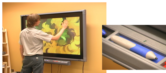
Figure 1: Hand postures in use and a pen as physical prop.

We extend the Interactive Canvas [SIMC07] that supports the creation of stroke-based renderings (SBR, [Her03]). The previous system only allowed indirect interaction through a set of widgets: a palette, tools, and a pre-defined set of primitives. During informal observations of the system's use, we discovered that this type of interaction was not sufficient to allow people to express their creative ideas. Several people expressed, in particular, the desire to create their own strokes in order to have more creative freedom. One person mentioned, e.g., that it is “hard to find a good cloud texture.” When more formally studying [GHC*07] an adapted system with an on-screen menu controlled by a separate Wii Nunchuck instead of the palette we gathered that participants