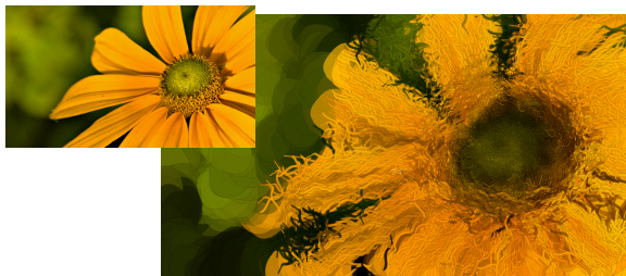
Figure 5: Using a background image (top) a stroke-based rendered image was created in less than 5 minutes (bottom).

Fig. 5 shows an example in which the technique was applied to create an NPR version of a photograph. Notice how the different regions of the picture are expressed using a number of unique, self-created stroke primitives. While this technique may be useful for artists, we see its main user group in the general public: People will be able to experiment with their personal photographs as touch-sensitive displays are becoming increasingly common. The use of easy and intuitive hand postures will allow users to employ a range of styles without having to resort to looking up menu options.