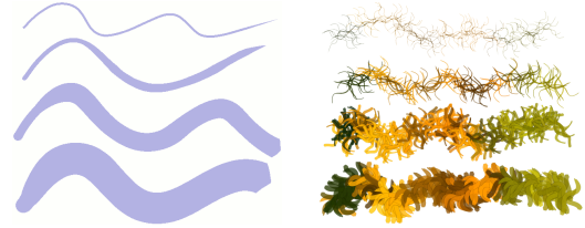
Figure 3: Strokes can be sketched with pen, one finger, two fingers, fist (left side). Strokes are rendered to texture and distributed with the one finger posture (shown on the right side) or the fist posture (this would produce more strokes within a larger region). The different colors of the strokes on the left side are derived from the underlying color image.