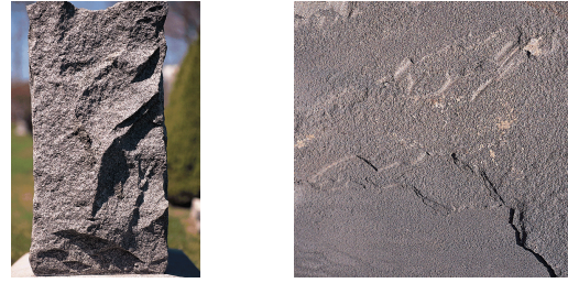
(a) Split finished granite.

In contrast, hand-drawn images may feel less sterile as many natural surfaces (see Figure 3), have statistical properties that imply self-similarity. If these natural properties also exist in hand-drawn images, this difference could explain the visible dissimilarities between hand-drawn and computer-generated images.